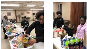
7 Food Baskets were distributed to families at Christmas