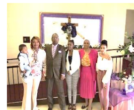
Easter Sunday Families