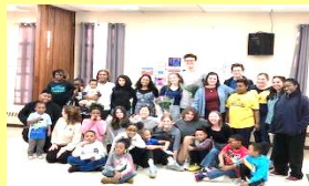
Friday Nights Arts Program Closing Showcase