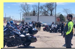
Blessing of the Motorcycles Sunday